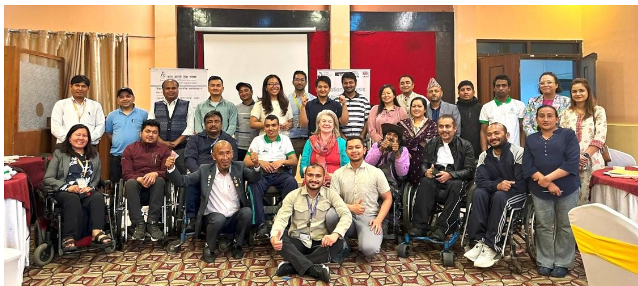
Figure 1. Multi-stakeholder participants of the Wheelchair Provision Workshop organized at Kathmandu, Bagmati Province.

Following these interviews, plan for more in-depth multi-stakeholder participation workshop was proposed which would focus on situational analysis of wheelchair provision across varying geographical locations over 4 provinces: Koshi (n=28), Bagmati (n=27), Gandaki (n=31) and Lumbini (n=30).