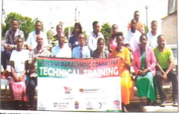
EQUIPPED WITH KNOWLEDGE-Participants-Picture by Up

MPC empowers Para Powerlifting technical officials