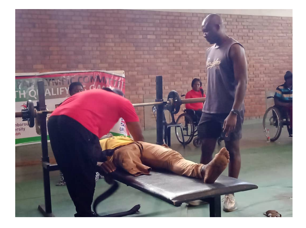
Malawi: Athlete training camp activities