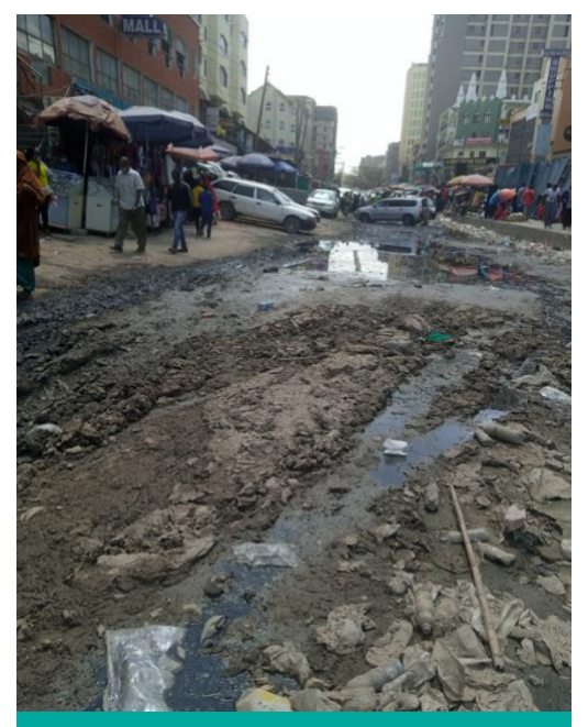
A flooded road in downtown Nairobi. Street stalls and the road conditions also create pedestrian inaccessibility

In terms of becoming a more inclusive city, Nairobi has some complex contextual factors that influence the state of the built environment. Nairobi's colonial era created segregated urban development planning approaches which generated conditions for exclusion that resulted in, among others, the birth and growth of informal settlements. These urban areas are characterised by high density and poor or lacking infrastructure and are some of the most inaccessible parts of the city. Due to high levels of poverty among persons with disabilities and high costs of housing, these are also areas where many disabled citizens live. Informal settlements in Nairobi are also high-risk areas for disasters such as flooding, fires and disease outbreak. These risks are due to, among others, poor or lacking infrastructure such as proper sewer and power systems, roads, and water and sanitation facilities.