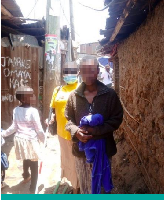
A woman is walking with her guide in the informal settlement.

conditions. There is also a good policy basis to make progress towards disability inclusion. It is important these two agendas are coordinated. Kenya enacted its first disability law, the 'Persons with Disabilities Act' in 2003 and ratified the UNCRPD in 2008. According to official statistics, around 1.1% of Nairobi's population are persons with disabilities, but it is recognised that this is likely an underestimation and the need for inclusive and accessible environments is much higher. Nairobi as the capital city of Kenya has a real opportunity to lead by example in terms of inclusive city design, not just for cities in Kenya but across the continent, as a key African commercial hub.