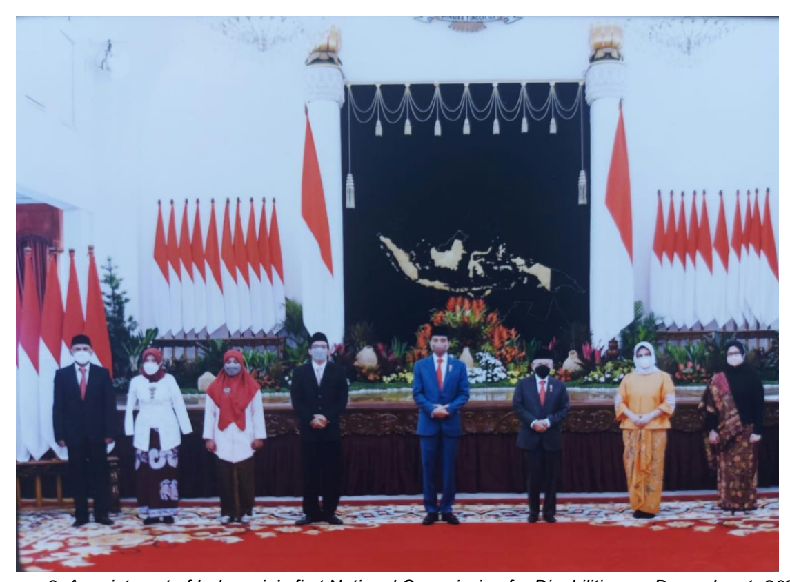
Image 3: Appointment of Indonesia's first National Commission for Disabilities on December 1, 2021

evaluating, advocating for the implementation of respect, protection, and fulfilment of the rights of persons with disabilities, including access to AT in Indonesia.